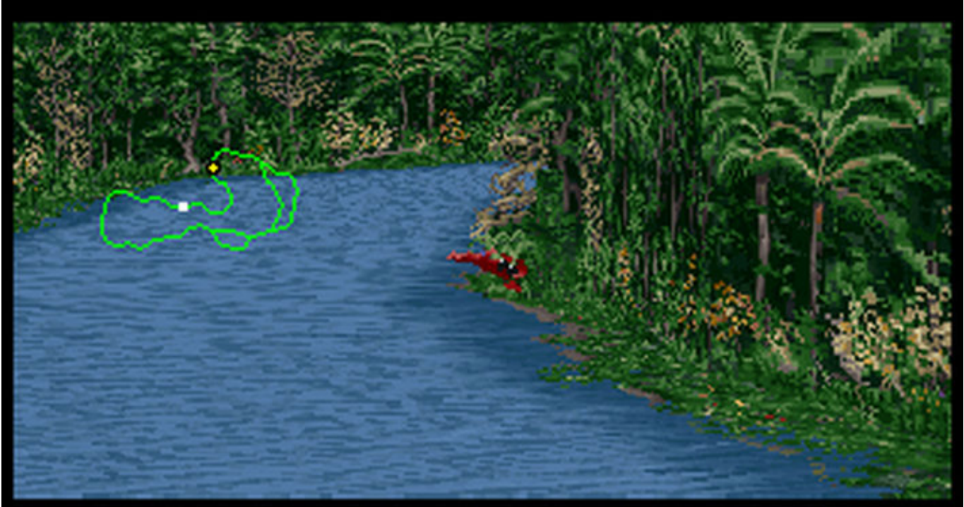
Beginning to angle to the left as we hurtle along Arawaks, the first of the two wide arcing bends running here in succession.